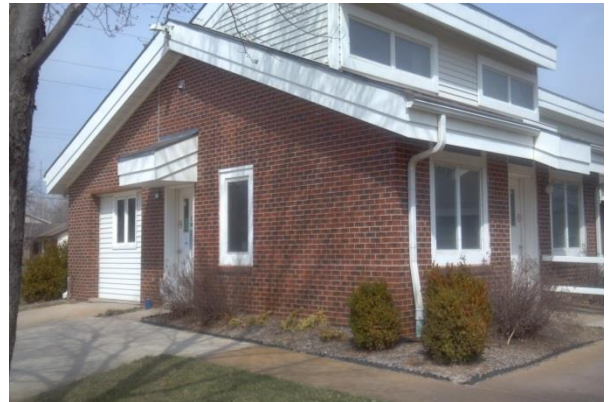
Housing Authority Office – 815 W 6 th

We would love for tenants to contribute recipes, ideas, stories, or celebrations etc.